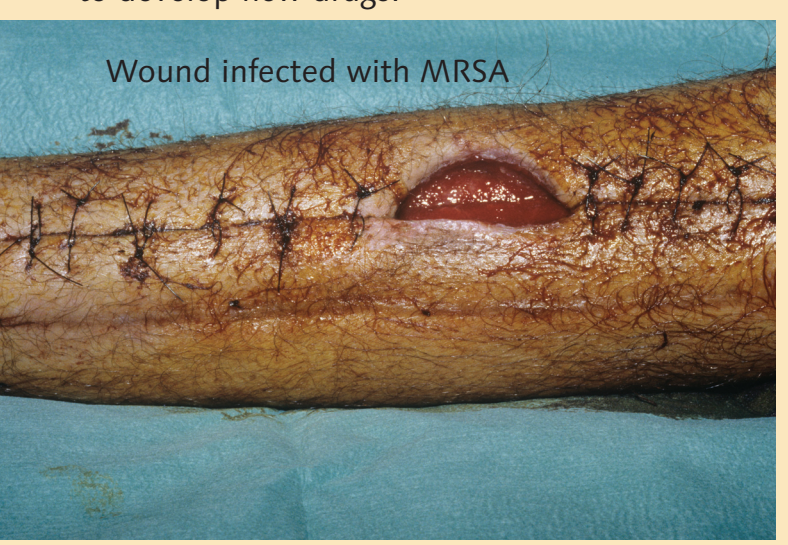
Web links — Search for MRSA www.sgul.ac.uk www.cdc.gov

Because MRSA is so widespread in our hospitals, prevention and treatment with flucloxacillin is now not effective. We are now dependent on the last reliable antibiotic class, vancomycin. This drug does not work as well, is more expensive, has side effects and has to be administered in hospital. Even with treatment 25% of patients that develop MRSA bacteraemia will die. This equates to approximately 2000 people each year. The UK has one of the highest rates of MRSA infection in Europe, but it is not as high as in the USA. Very recently, new antibiotics have been introduced to fight MRSA. However, they are all very expensive, and it is likely resistance will develop to them quickly, so they are often kept in reserve and not widely used. This makes it uneconomical for pharmaceutical companies to develop new drugs.