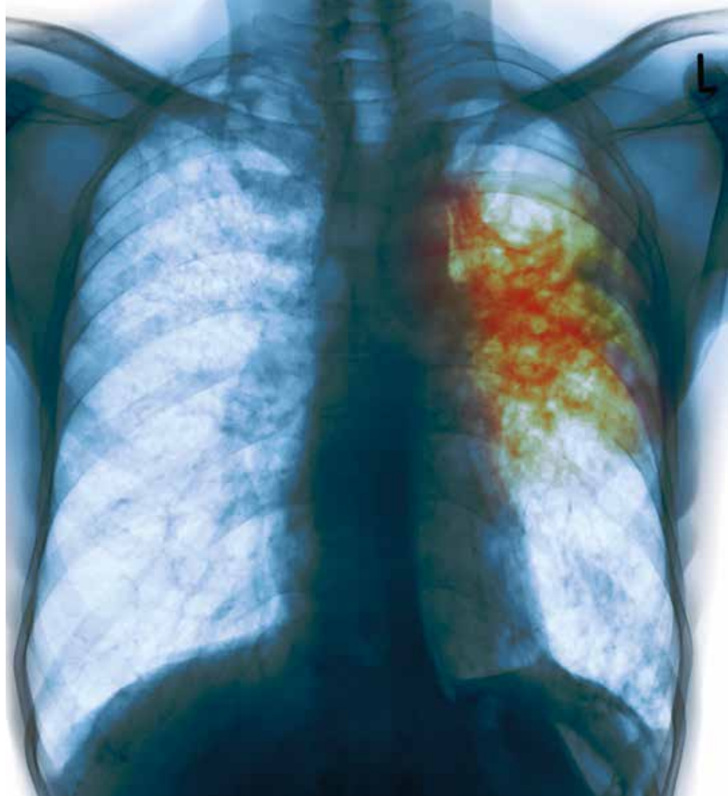
Coloured X-ray of the chest of a male patient with pulmonary TB. The affected areas of the lungs are red.

Most mycobacteria are non-pathogenic and are found in habitats such as soil or water, for example Mycobacterium smegmatis . Some are opportunistic pathogens of humans, for example Mycobacterium avium is a problem in AIDS patients and Mycobacterium marinum which naturally infects fish and frogs, can cause ulcerative skin lesions in humans. A few species are obligate