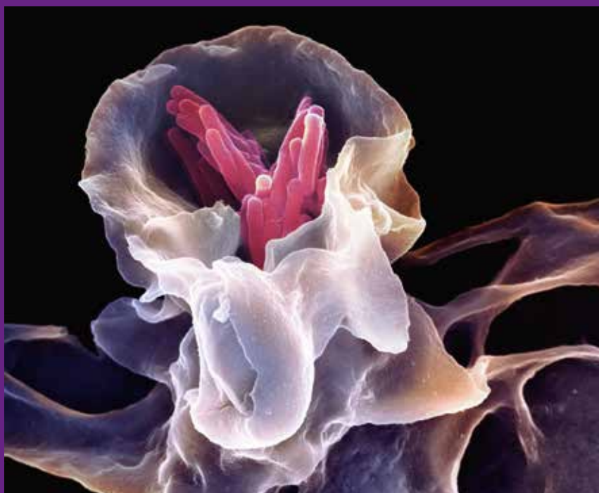
Coloured scanning electron micrograph of a macrophage (purple) engulfing TB bacteria (pink).

CD4+ T cells. These are helper cells which have a molecule called CD4 on their surfaces. CD4+ T cells bind to the antigen presented by the antigen-presenting cells. The CD4+ T cells then secrete cytokines, molecules which cause the macrophages and other