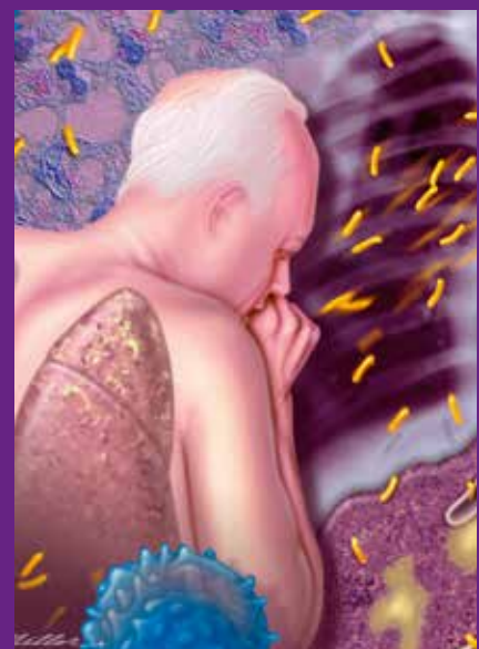
A conceptual illustration of TB.