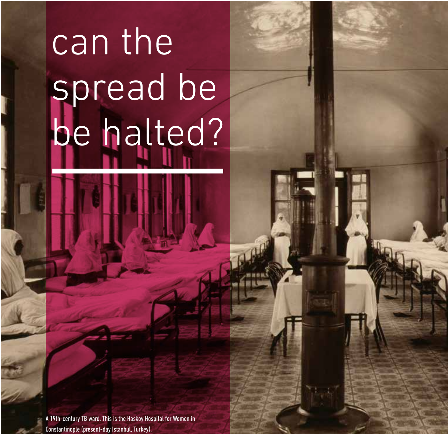
A 19th-century TB ward. This is the Haskoy Hospital for Women in Constantinople (present-day Istanbul, Turkey).