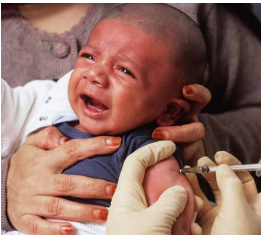
Four-week-old baby boy receiving a BCG vaccination.

In 1921, Albert Calmette and Camille Guérin of the Pasteur Institute in Paris developed the BCG vaccine from a live attenuated strain of M. bovis which is used today, with around 388 million doses being administered worldwide each year. It took 13 years of