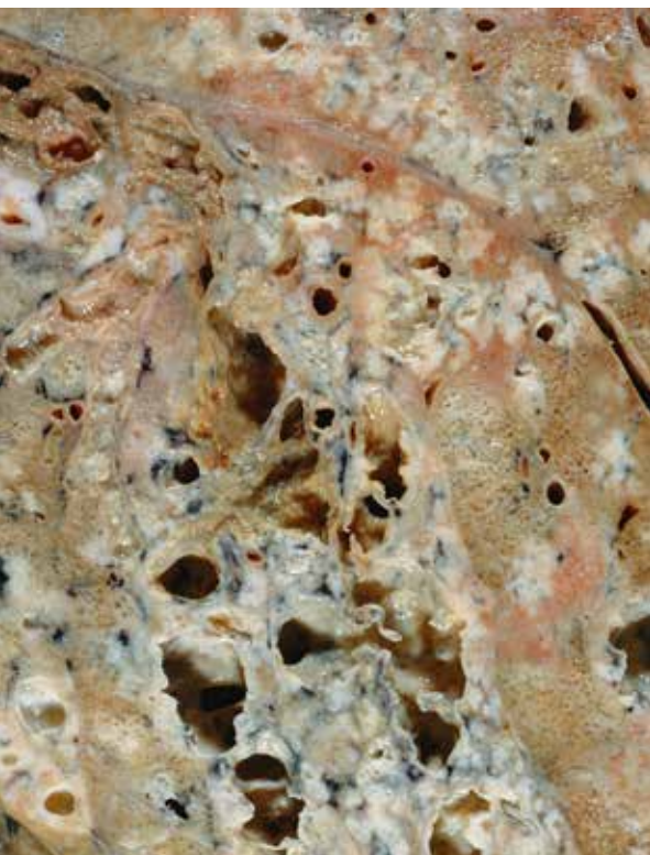
Specimen of lung tissue showing lesions caused by TB.

There are several other treatment-shortening trials in progress and we eagerly await the results. Even if we can shorten treatment to 4 months, compliance rates will rise and cost of treatment will drop, making treatment more accessible to all.