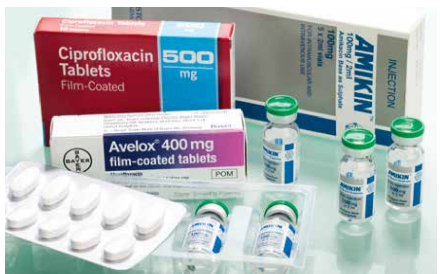
Selection of second line drugs that are used to treat TB, including Amikin, Avelox and ciprofloxacin. Second line drugs are used when the bacteria have become resistant to, or the patient is unable to take, the first line drugs.

A problem with treatment arises when patients stop taking the drugs as soon as they feel better, because of inconvenience, unpleasant side effects of the drugs or to save money. This is mainly seen in patients in poorer countries or those of low socio-economic status in developed nations. Badly supervised, incomplete or wrong treatment programmes may lead to recurrence of illness in the individual and the emergence of drug-resistant strains of M. tuberculosis . Examination